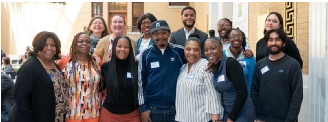
CSNDC staff members at the Massachusetts Statehouse on Lobby Day, May 13, 2024

Attended Chew and Chat and Donuts for Delegates events