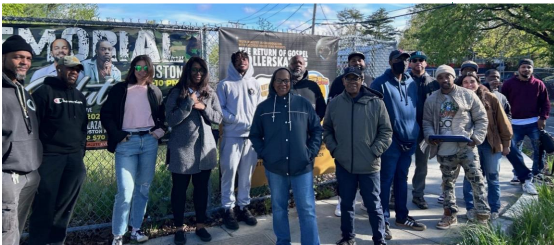
Graduates of the May 2024 Green Infrastructure training in front of the bioswale installation on New England Avenue