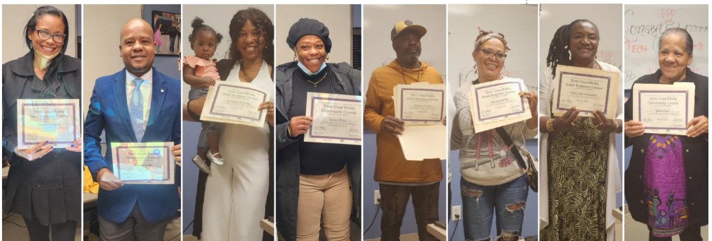
Proud graduates of the Tech Goes Home course at the CLC